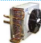
Condensatore remoto Optional Remote condenser Optional